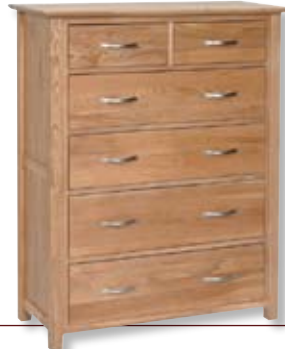
NC80 2 over 4 Combination H 1240mm (48½"); W 978mm (38½"); D 425mm (16¾")