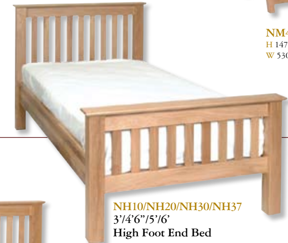
NH10/NH20/NH30/NH37 3'4"6"/5'6' High Foot End Bed