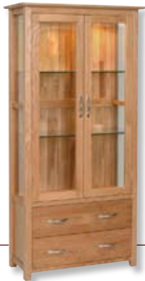
NG40 Glass Display Unit H 1800mm (71"); W 875mm (34¼"); D 390mm (15¾")