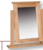
NM05 Mirror H 584mm (23"); W 530mm (20¾")