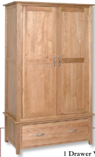
NW30 1 Drawer Wardrobe H 1910mm (75"); W 1100mm (43"); D 587mm (23")