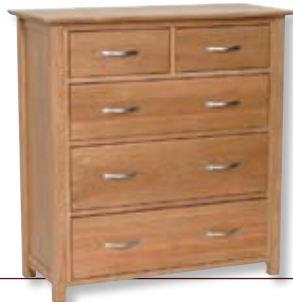
NC70 2 over 3 Combination H 1020mm (40"); W 978mm (38½"); D 425mm (16¾")