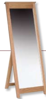
NM40 Mirror H 1470mm (57¾"); W 530mm (20¾")