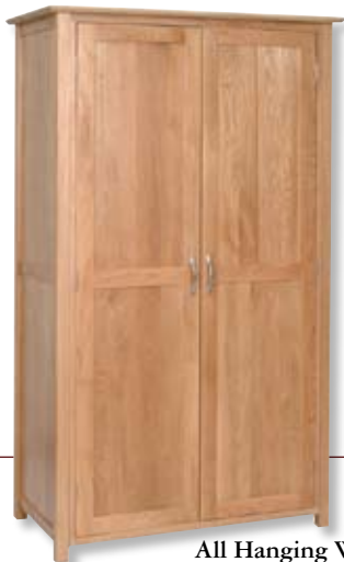
NW20 All Hanging Wardrobe H 1910mm (75"); W 1100mm (43"); D 587mm (23")