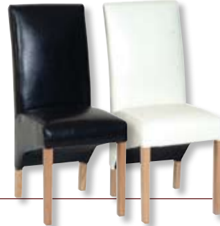
NH13/NH14 Dining Chair (Brown / Cream) H 1040mm (41"); W 440mm (17¼"); D 610mm (24")