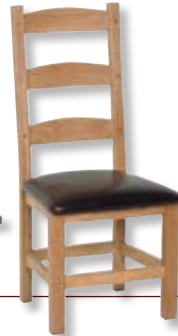
NH11 Dining Chair H 1040mm (41"); W 440mm (17¼"); D 610mm (24")