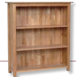
NK20 3' Bookcase H 1070mm (42"); W 980mm (38½");