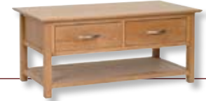
NT15 Coffee Table H 500mm (19¾"); W 1100mm (43¼");