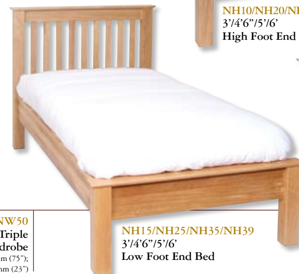
NH15/NH25/NH35/NH39 3'4"6"/5'6' Low Foot End Bed