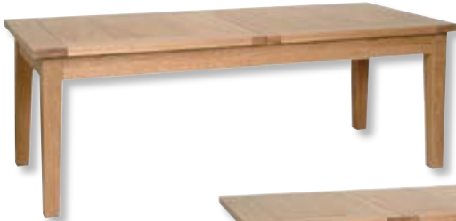
NT08 Extendable Dining Table 3' x 6'8", extending to 9' H 775mm (30½"); W 915mm (36"); L 2035mm (80") / 2750mm (108")