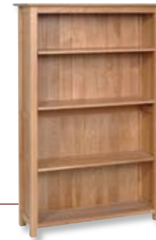
NK30 5' Bookcase H 1500mm (59"); W 980mm (38½");