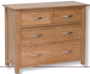
NC60 2 over 2 Combination H 770mm (30¼"); W 978mm (38½"); D 425mm (16¾")