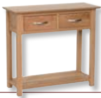
NT20 2 Drawer Console Table H 770mm (30¼"); W 850mm (33½"); D 350mm (13¾")