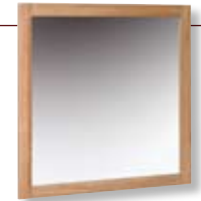
NM25 Wall Mirror H 900mm (35½"); W 900mm (35½")