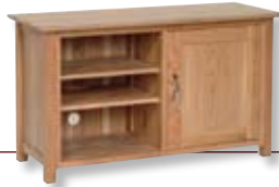
NE20 Standard Video Cabinet H 645mm (25½"); W 1100mm (43¼"); D 425mm (16¾")