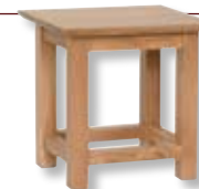
NT35 Lamp Table H 400mm (15¾"); W 400mm (16"); D 330mm (13")