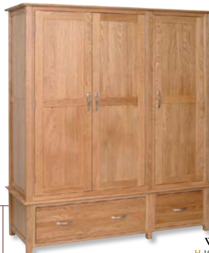
NW50 Triple Wardrobe H 1910mm (75"); W 1633 (64¼"); D 587mm (23")