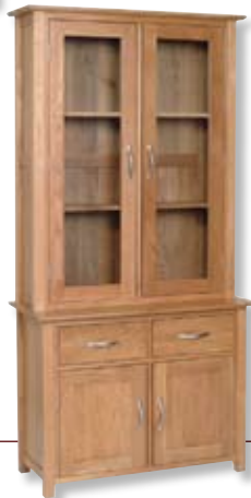
NS20 3' Dresser Base H 770mm (30¼"); W 980mm (38¼"); D 425mm (16¾")