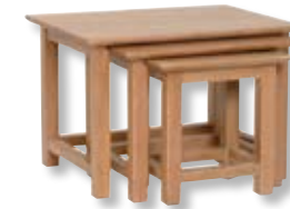
NT30 Nest of Tables H 460mm (18¼"); W 672mm (25½"); D 530mm (21")