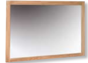
NM30 Wall Mirror H 900mm (35½"); W 1300mm (51")