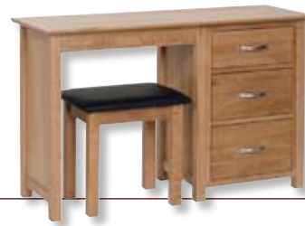
NS10 Stool H 460mm (18"); W 450mm (17¾"); D 350mm (13¾")