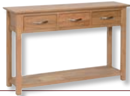
NT25 3 Drawer Console Table H 770mm (30¼"); W 1185mm (46½"); D 350mm (13¾")