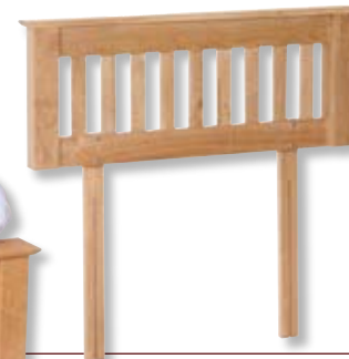
NH40/NH50/NH60/NH70 3'4"6"/5'6' Headboard

Crafted from solid oak, this range has a contemporary feel - blending style with traditional construction features.