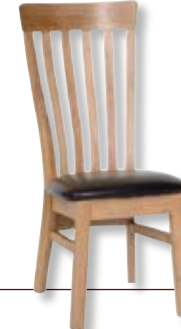
NH12 Dining Chair H 1040mm (41"); W 440mm (17¼"); D 610mm (24")