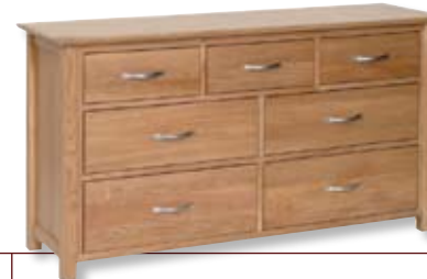
NC90 3 over 4 Combination H 770mm (30¼"); W 1378mm (54¼"); D 425mm (16¾")