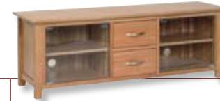
NE30 Large TV Unit with Glass Doors H 500mm (19¾"); W 1400mm (55");