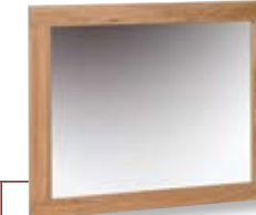
NM20 Mirror H 597mm (23½"); W 750mm (29½")