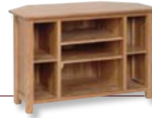
NE10 Corner Video Cabinet H 645mm (25½"); W 982mm (38½");